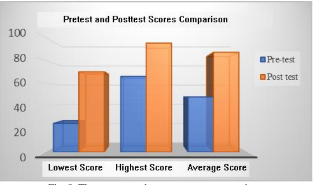
Fig. 8. The pre-test and post-test score comparison.

Based on the test results, the average pre-test score (initial test) in Fig. 8 was 48, and the average post-test score (final test) was 87, with a student progress score of 39. The average initial score before using Lampung local wisdom-based educational film differed from the average final score after using the developed media.