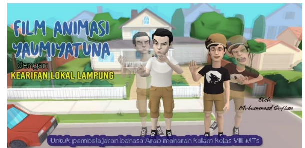
Fig. 2. The opening scene of the film.

The thumbnail and title of the educational film are displayed in the opening scene. There is also the name of the educational film developer and learning objectives. Learning objectives contain goals to be achieved in learning Arabic communication skills.