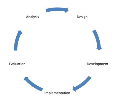
Fig. 1. The steps of the ADDIE development model [62].

The development stages according to Fig. 1 are as follows: