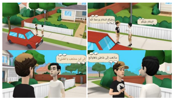
Fig. 4. The dialogue content in the film.

The educational film features a sequence of animated dialogues with the concept of Yaumiyatuna and murodat-mufrodat related to the subject. The local wisdom-based educational film is offered in simple animation with simple words. This educational film tells the story and includes images of mufrodat and supporting text that explains the conversation's topic. The story in this film is a trip to build a sense of togetherness. Students travel to Pahawang Beach to know the beauty of the beach and snorkeling to see the beauty of the underwater world in the form of marine animals, coral reefs, and clean sea panoramas. The movie also tells the story of students' togetherness in eating Nyeruit at the Pahawang beach resort as a form of maintaining Lampung's local culture.