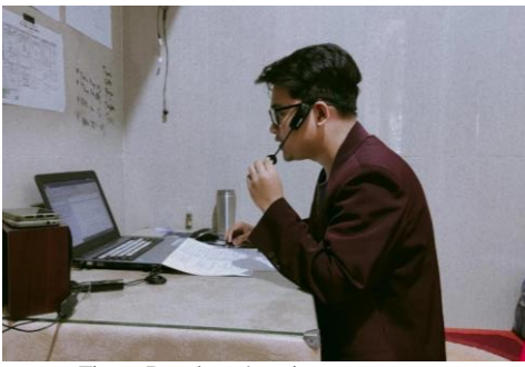
Fig. 6. Developer's voice-over process.

Fig. 6 shows that the researcher's smartphone's built-in voice recorder app was used for audio recording and a laptop was used for editing. Researchers employed a microphone to improve the audio quality. Each scenario's audio was recorded separately, with each scene lasting no more than 20s. This development was done using simple tools so that others could follow suit to develop it without high costs but produce high-quality products.