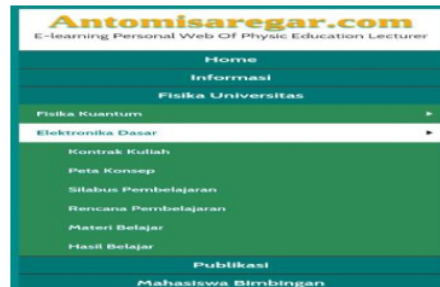
Figure 3 The Display of basic electronics

Figure 3 shows the Basic Electronics learning in the form of study contracts, learning concept maps, learning syllabus, learning specifications, materials, and grades which include 16 meetings.