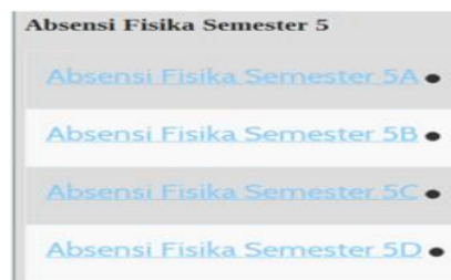
Figure 6 Display of Attendance

Basic Electronics Lecture in Direct Current Electrical Circuits includes 5 meetings. Lecturing materials are presented in the form of modules, Power Point, Phet Simulation, learning videos, and sample questions. The display is shown in figure 5-9.