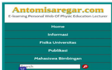
Figure 2 Home Page of the web

Figure 2 shows the home page of the web which consists of several parts, namely home, information, Physics University, publications and students. The Information section consists of Physics Education Department, the latest UIN news, student and lecturer's academic system. The Physics University section consists of quantum physics and basic electronics. The publication section consists of scientific journals, reputable journals, and the latest articles. In the student section, the guidance consisted of a list of lecturers' academic guidance students.