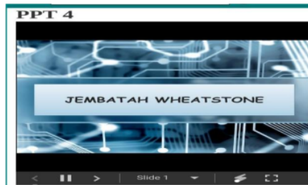
Figure 8 Display of PPT