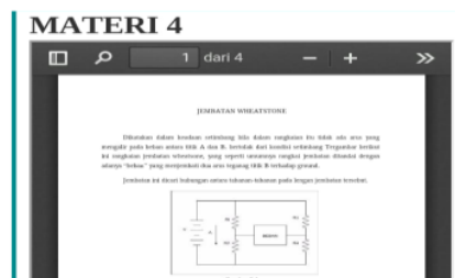
Figure 7 Display of Material