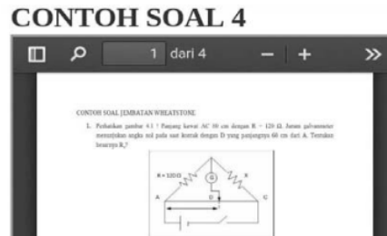
Figure 9 Display of Sample Questions

The Preliminary Field Testing stage is the validation of Web-enhanced course on Basic Electronics courses conducted by 8 experts that consisted of 3 material expert, 3 media experts, and 2 IT experts. After validation by experts was done, the next step was revision of the media and then tested the product on physics Education students of UIN Raden Intan Lampung in sixth semester. The Main Product Revision stage was to revise the validated product. The following are the results of the validation and revision of material experts, media experts, and IT experts.