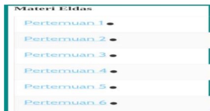
Figure 4 The Display of Basic Electronic Part