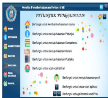
Figure 3. Lesson Instruction

The software-based instructional media Lectora Inspire provides a learning instruction as follows: user instruction, basic competences of lesson, lesson contents in the form of text, images, and videos, it is followed by learning evaluation. At the end of the part, it presents a bibliography and references. The following Figures 3 is the user interface of Lectora Inspire.