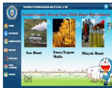
Figure 4. Content in the form of images