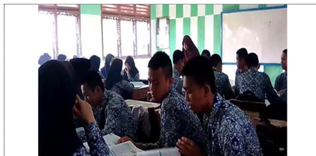
Figure 2. Presents a Problem

Figure 1 shows the steps of the STEM learning approach in the Inquiry model used in the experimental class. These steps encourage students to make an observation of various phenomena or contents and then construct questions from such phenomena. The students are motivated to be able to solve existing problems and try to communicate them.