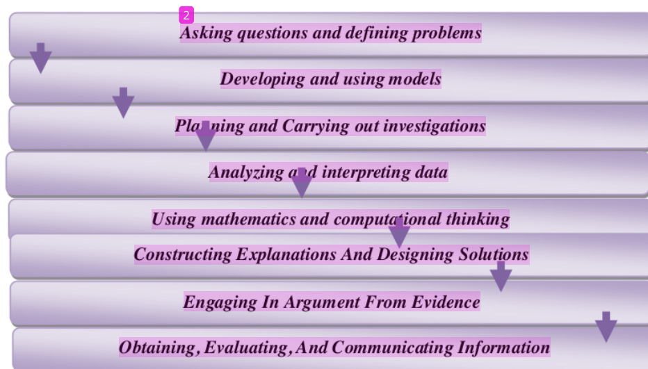
Figure 1. Steps of the STEM Approach in the Inquiry Model

develop scientific attitudes and students' conceptual understanding. The steps for the STEM approach in the Inquiry model are presented in chart 1[40].