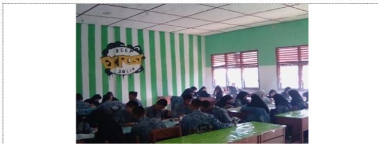
Figure 3. Students are Given the Opportunity to Solve Problems

In the third stage, the students were asked to plan and carry out scientific investigations to obtain data. For the innovations obtained to be more meaningful, the researcher asked the students to generate new ideas that are worthy to be applied in social life. Then, in the fourth stage, after the students conducted scientific investigations and obtained data, the data obtained was then analyzed and then interpreted.